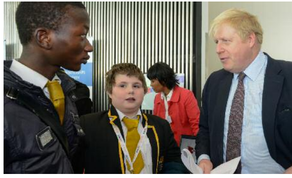
Inspiring the Future Apprenticeships Careers Fair at City Hall Long February 2014.

The most popular group of volunteers available to teachers through Inspiring the Futures are people able to speak to young people about Apprenticeships. There are now more than 3,000 such volunteers and over the last eighteen months, thanks to generous support from the Skills Funding Agency, they have engaged with 250,000 young people at hundreds of events in schools, colleges and communities across England. After speaking with volunteers, young people overwhelmingly report that they learnt something new and useful about Apprenticeships, challenging misconceptions with the majority saying they will go on to find out more themselves about what they have to offer, how they vary and how they can get onto one. Careful analysis undertaken with the Agency shows that, within months of meeting volunteers, many young people aged 16-18, have registered on the national Apprenticeship Vacancy Matching Service with the majority going on to apply for Apprentice opportunities. Through Inspiring the Future, young people are broadening aspirations and picking up expert tips on how to make those ambitions a reality.