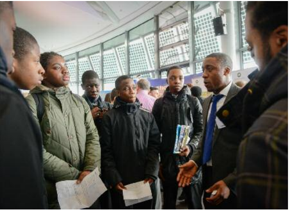
Inspiring the Future Apprenticeships Careers Fair at City Hall London, February 2014.

91% of apprenticeship volunteers were approached by schools within three months of registering on Inspiring the Future.