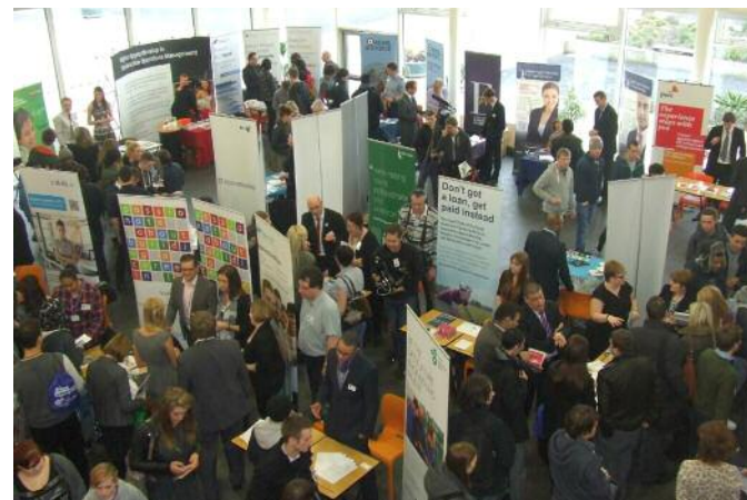
Higher Apprentice Careers Fair at the Co-operative Academy