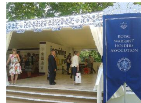
Inspiring the Future took part in the Coronation Festival at Buckingham Palace as guests of the Royal Warrant Holders Association